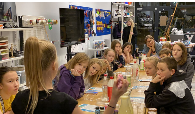
Left: VIVITA Estonia Slime making workshop. Right: VIVITA Lithuania making face shields.