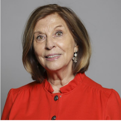
BARONESS D'SOUZA Former Lord Speaker

This report deals with both. The Covid crisis has had, and will continue to have, deep consequences – among the most important being the widening gap between the “just about managing” and the severely poor. The latter group of people will be disproportionately affected with a consequent drop in education, of girls primarily, and the inevitable unemployment figures that will follow countries that have an abundance of talented and motivated young people. This is a waste and a tragedy – it is also a cause of social and political unrest.