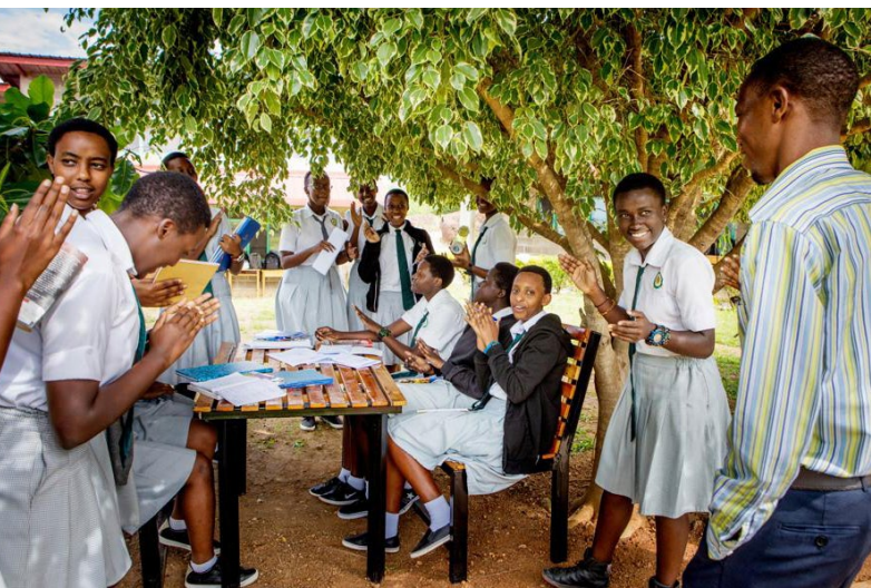
Teach a Man to Fish's School Enterprise Challenge.